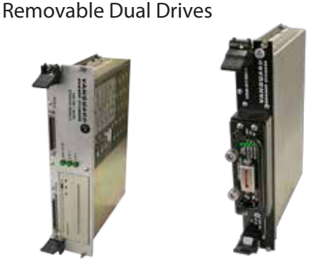
6U, 2S Air Cooled Removable Drive, Battery Back-Up