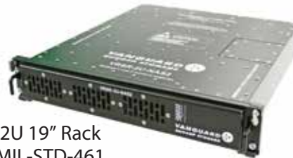
2U 19" Rack MIL-STD-461