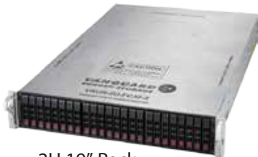
2U 19" Rack, Commercial, Unshielded