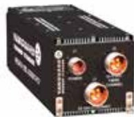
1/2 ATR Compact MIL-STD-461