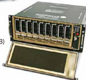
4U 19" Rack MIL-STD-461 (Up to 1440 TB)