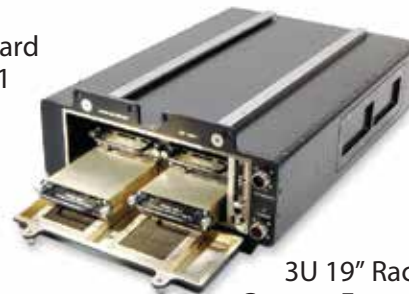
3U 19" Rack Custom Front Plate MIL-STD-461