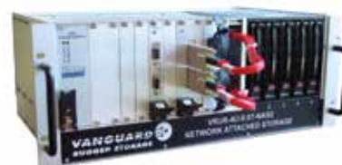
VPX, 4U 19" Rack Unshielded