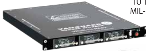
1U 19" Rack MIL-STD-461