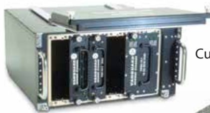
4U 19" Rack, Custom Front Plate, MIL-STD-461