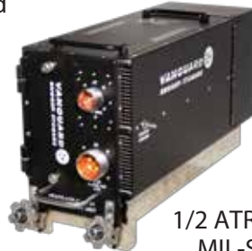
1/2 ATR Standard MIL-STD-461