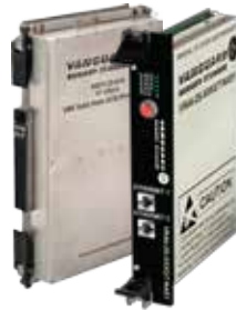
2 Slot Blades VPX, cPCI Serial, cPCI, VME